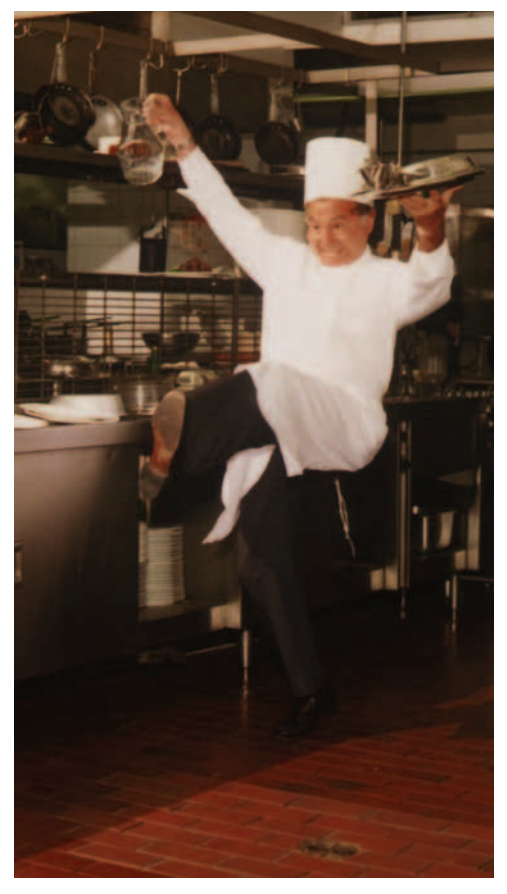
Ideal For Commercial Kitchens.

This profile is so subtle that it cannot be felt or seen. Because the profile sits BELOW the level of the surface, it does not affect the cleaning process as with a profile that stands ABOVE the surface such as an anti slip paint coating.