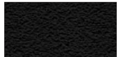
NS5100B Black Grit